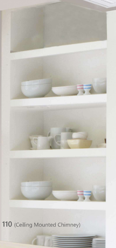
SKYVENT 110 (Ceiling Mounted Chimney)